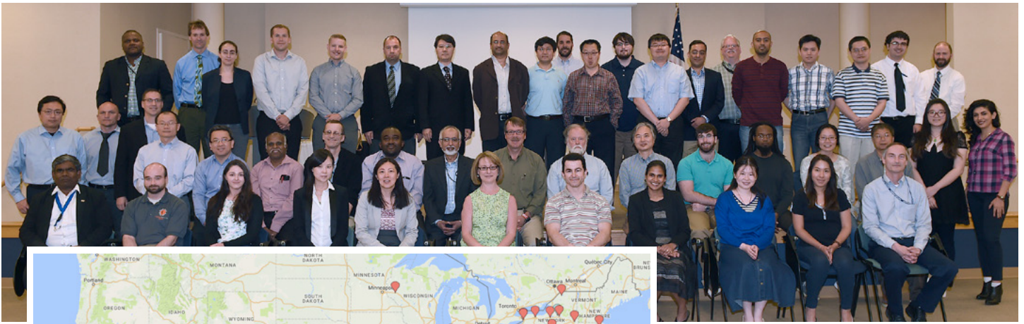
2016 Visiting Faculty Research Program (VFRP) & Mentors