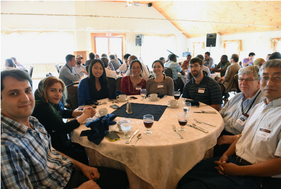
2016 Visiting Faculty Research Program (VFRP) participants and advisors